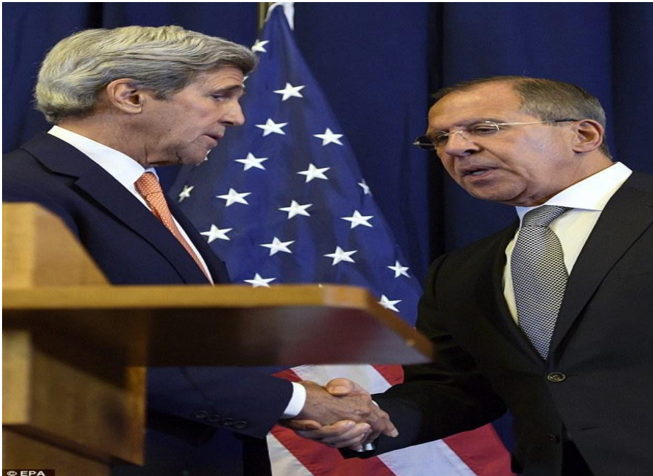
US Secretary of State John Kerry (left) and Russian Foreign Minister Sergey Lavrov agreed to a Syria ceasefire in Geneva, Switzerland, on Friday in order to tackle ISIS and Al-Qaida