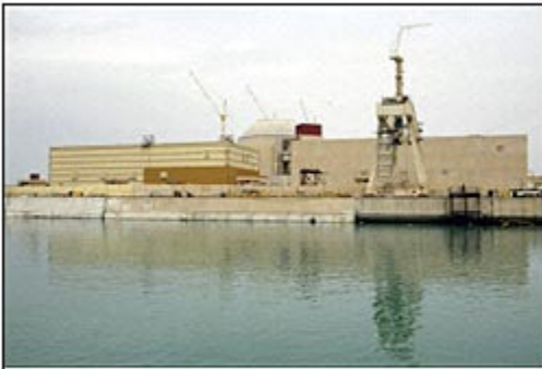
Iran's Bushehr nuclear power plant, 1300 km south of Tehran

The International Atomic Energy Agency (IAEA) referred Iran to the United Nations Security Council for being in breach of the Nuclear Non-Proliferation Treaty's (NPT) safeguards agreement. Teheran has responded to the referral by ending diplomacy, stopping cooperation with the IAEA and starting "industrial scale" Uranium enrichment that could produce dozens of nuclear warheads per year.