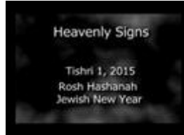
Rapture - Fall 2008? (Pt 2 of 6)