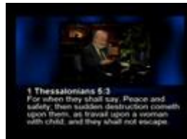
Rapture - Fall 2008? (Pt 5 of 6)