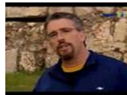
Rapture is on Rosh HaShanah Pt 3