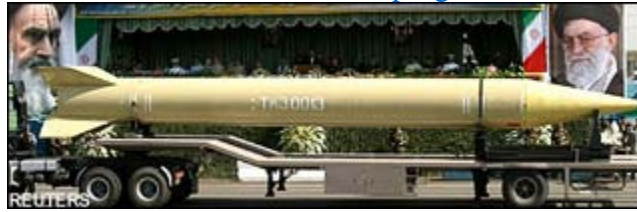
An Iranian Shahab-3 missile on parade in Teheran

nuclear bomb. The discovery will intensify international pressure on Teheran to provide a comprehensive breakdown of its nuclear research programme .