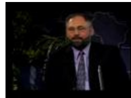
Rapture - Fall 2008? (Pt 6 of 6)