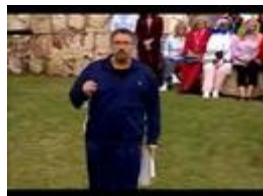
Rapture is on Rosh HaShanah Pt 1