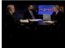
Rapture - Fall 2008? (Pt 1 of 6)

For more information go to videos by Perry Stone: