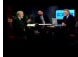
Rapture - Fall 2008? (Pt 3 of 6)