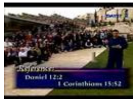
Rapture is on Rosh HaShanah Pt 2