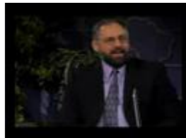
Rapture - Fall 2008? (Pt 4 of 6)